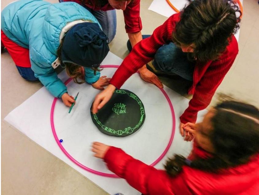
Students drawing trajectories in the Collisions activity.